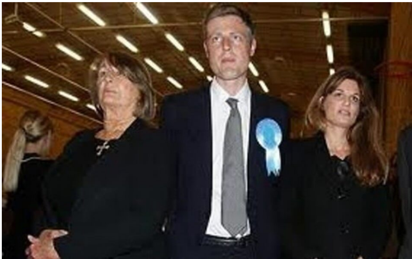
Zac Goldsmith (married to Kate Rothschild) winning the election with sister, Jemima Khan (nee Goldsmith)(right), and mother, Annabel Goldsmith

trillion—dwarfing the net worth of the likes of Warren Buffet, Bill Gates, Ted Turner, etc.